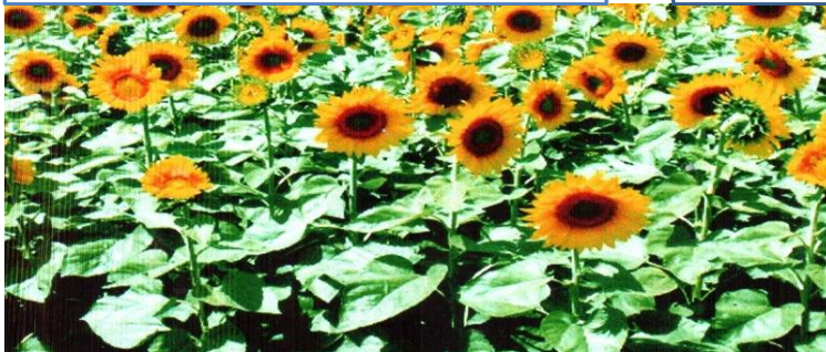
Sunflower Demonstrations in Summer Season