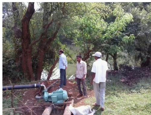
Lift Irrigation system Executed by Mahalaxmi Cluster from Kasari River For 17.90 Ha.