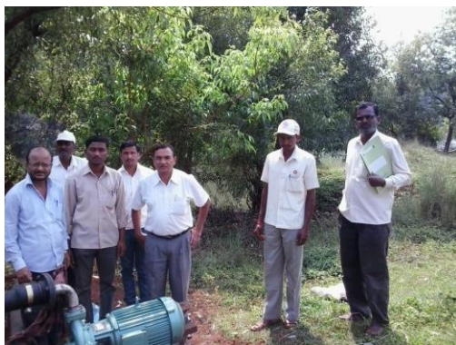
Lift Irrigation system Executed by Haritkranti Cluster from Kasari River For 11.10 Ha.