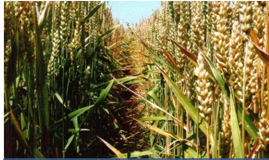
Wheat Demonstrations Conducted in Rabi Season