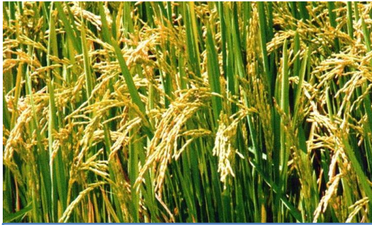
Paddy Demonstrations Conducted in Kharip Season